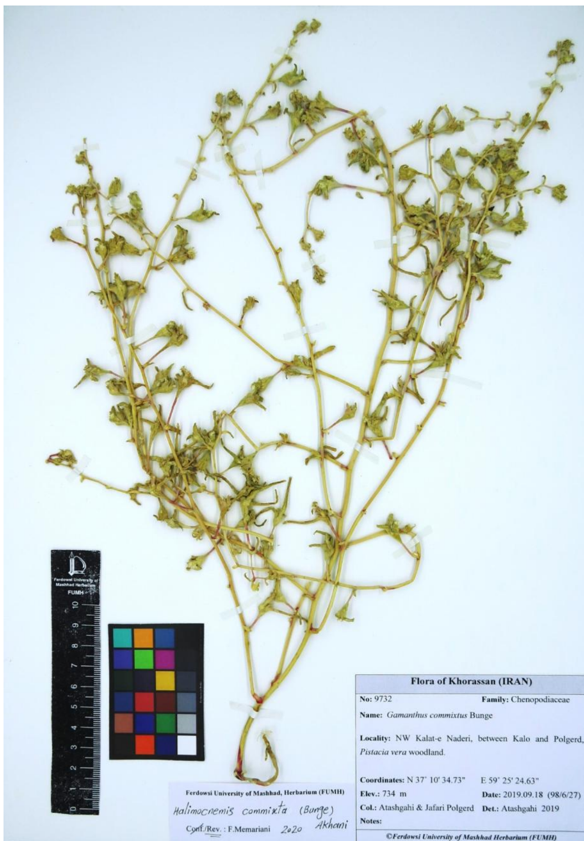
Figure 1. Herbarium specimen of Halimocnemis commixta (Atashgahi & Jafari Polgerd 9732-FUMH).