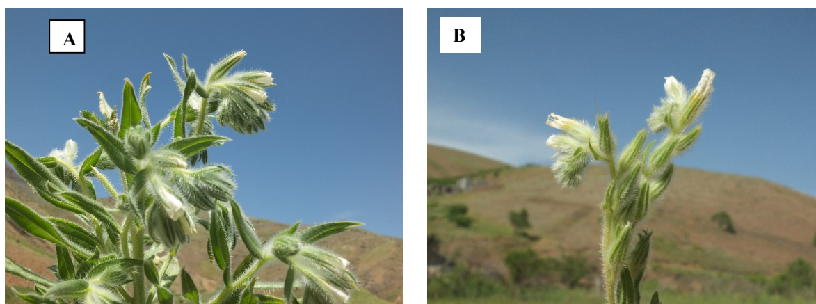
Figure 1. A. Onosma sulaimanica and B. Onosma bulbotricha . A part of inflorescence showing bract, calyx and corolla.