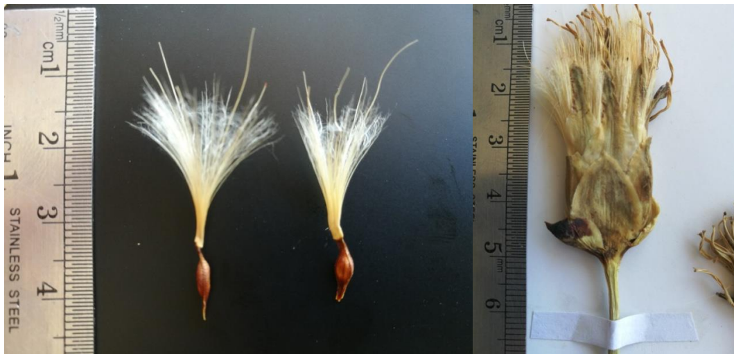
Fig. 2. Scorzonera incisa DC. Achene & Capitule, (Safavi & Nikchehreh 86132, TARI)