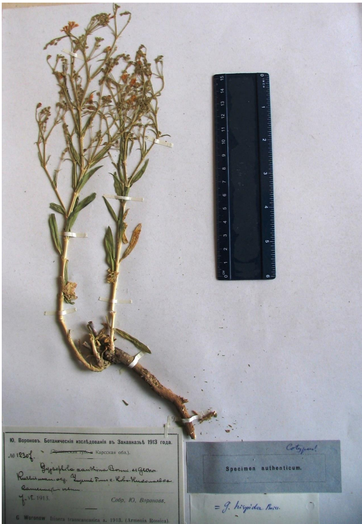
Fig. 2. Syntype of Gypsophila xanthina (Woronow 12307, LE!).