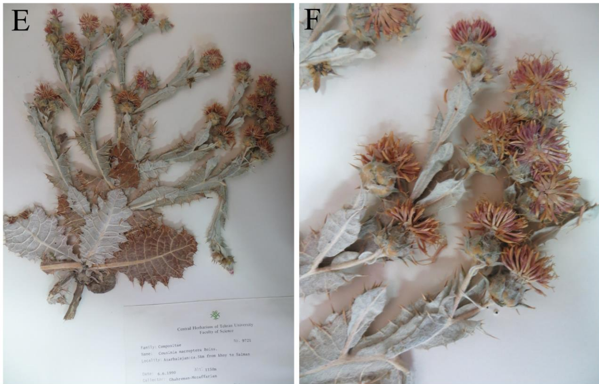
Fig. 2. E-F: Photos of Cousinia macroptera .