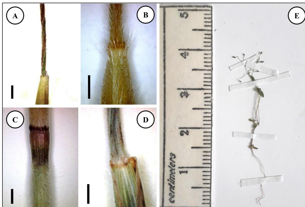
Fig. 2. A-D. Some details of morphological characters in Stipa richteriana (Memariani & Behroozian 46440, FUMH), scale bars = 1 mm. A. the minutely pubescent awn with twisted column. B. the entire lemma apex with a crown of hairs. C. the densely pubescent culm below the nodes. D. the collar showing the short membranous and ciliate ligule with densely pubescent leaves on upper surface. E. the dwarf Galium songaricum plant (Joharchi & Behroozian 46259, FUMH).

without keel, with 0.5 mm long ascending hairs, only the marginal hairs almost reaching the top, the top with a crown of 0.5-1.5 mm long hairs; awn bigeniculate, (5-) 6-7 cm long, minutely pubescent throughout, column densely twisted, with 0.2 mm long hairs, seta falcate with 0.5 mm long hairs; palea equalling lemma in length, glabrous, with a tuft of a few hairs at the apex; lodicules 3, 1.5 mm long, glabrous; anthers 3, 3-4 mm long, yellow; ovary glabrous, with 2 stigmas; caryopsis fusiform.