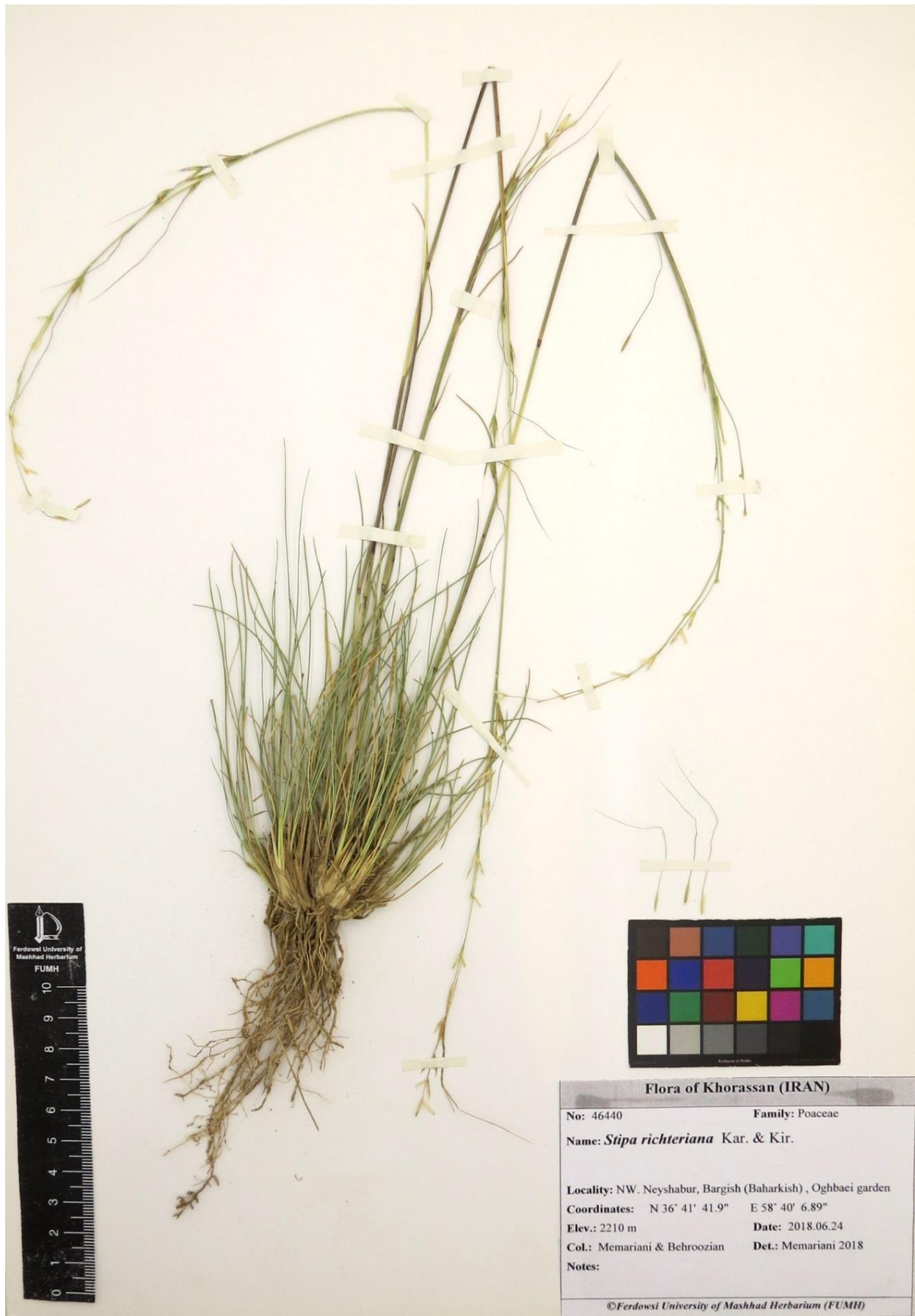
Fig. 1. Herbarium specimen of Stipa richteriana (Memariani & Behroozian 46440, FUMH).