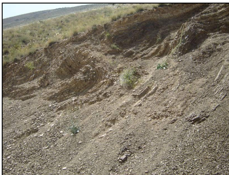
Fig.3 A part of Pourkan-Vardij fault zone

There are several faults in the tunnel route. The main fault zone and crushed zone is Pourkan-Vardij fault zone that cuts the tunnel route in 6417 to 6442 meter from end of the tunnel (Fig.3). It should be noted that CZ and FZ show crushed and fractured zones respectively due to fault activity.