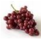
1 kilogram of grapes

Instructions: Your friend is going to the supermarket. Below is a list of TEN (10) things you need, in order to prepare dinner for you and your family. Use the phone to talk to her. Tell him/her in English what you need ( do not use Farsi to do this task ). If he/she does not understand what he/she has to buy, explain in English and use all of the details. You have 10 minutes to complete the task.