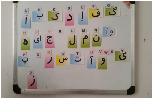
Picture 4, using Persian equivalent as mnemonic

After learning the letters and corresponding sounds, she was made to make the mono syllabic regular words using tactile, kinesthetic and visual senses (Picture 5). Based on MSL strategies Language concepts were taught in logical, sequential steps from simple to more complex tasks.