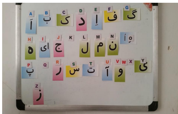
Picture 4, using Persian equivalent as mnemonic

After learning the letters and corresponding sounds, she was made to make the mono syllabic regular words using tactile, kinesthetic and visual senses (Picture 5). Based on MSL strategies Language concepts were taught in logical, sequential steps from simple to more complex tasks.