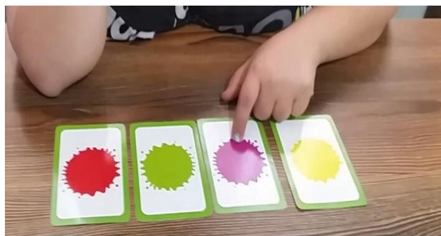
Figure 2, Flash cards

Considering her mental age (six years old) based on "Draw-a-Person tests", American First Friend 1 published by Oxford University Press was chosen. It is a phonemic program designed to develop letter recognition skill and letter formation. This book comprised of 10 units focusing on learning alphabets and vocabularies. Other material used along with the book were flashcards, Persian and English magnet alphabets and a magnet board. (Pictures 2 & 3).