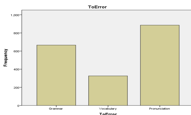
Figure 2. Types of errors

In order to examine the significance of the differences between the frequencies of the types of errors and their expected frequencies, a chi-square goodness-of-fit test was run. As shown in Table 8, the frequencies for vocabulary and pronunciation were noticeably different from their expected frequencies while the number of grammatical errors receiving CF was close the expected frequency for this error type. Based on the table, errors of pronunciation were treated more than expected, while errors of vocabulary were addressed greatly less than expected. According to the result of the chi-square test (Table 9), there were significant differences between the observed and expected frequencies for types of errors being treated through CF, X^2(2, n= 1878) = 244.1, p = .000 .