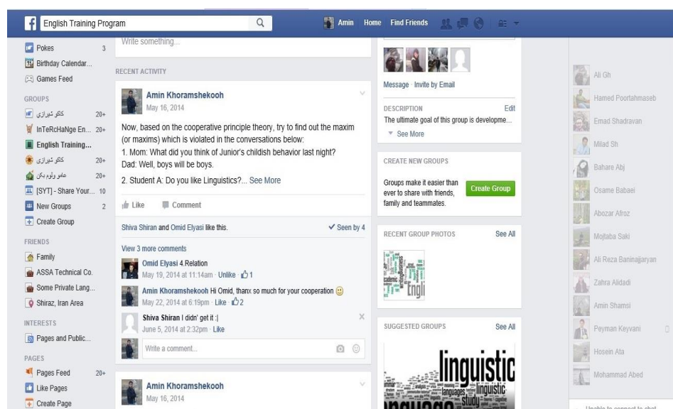
Figure 2 The ACMC group's virtual instructional environment

The participants of the control group, also, received the instructional materials two times a week (each time about half an hour) through traditional teacher-fronted classroom setting. In each session, they were provided with a dialogue containing implicatures in a specific context. Then, they were encouraged to interpret the dialogue and discuss it with their peers. Afterwards, they were given meta-pragmatic information about how to interpret each implicatures type.