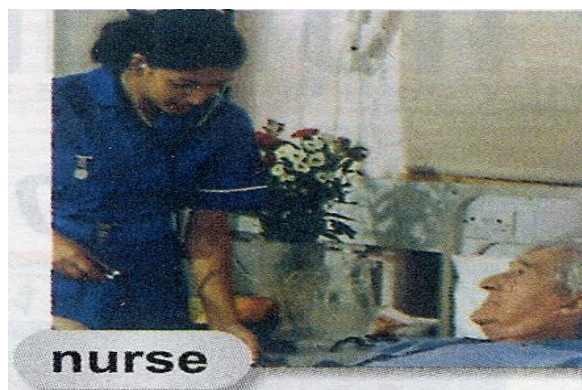
Figure 1: Interchange Student’s Book 1 (Richards, 2005, p. 15).