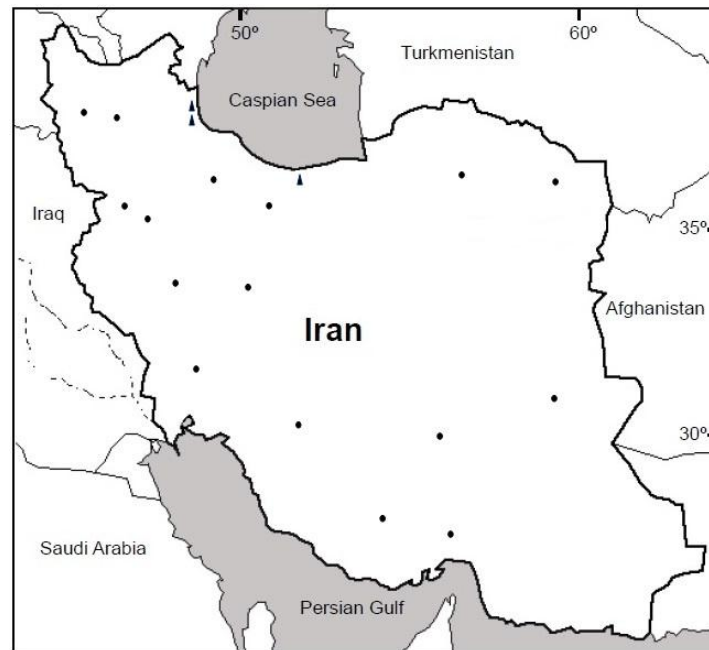
Fig. 3. Distribution of Alyssum szowitsianum (●) and A. mazandaranicum (▲) in Iran.