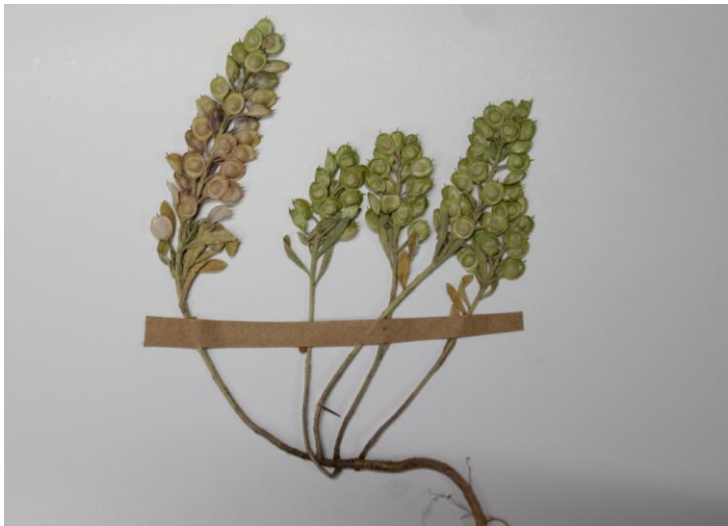
Fig. 1. Plant on sheet of Herbarium ( A. mazandaranicum ).