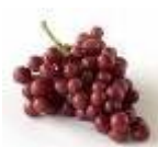
1 kilogram of grapes

Instructions: Your friend is going to the supermarket. Below is a list of TEN (10) things you need, in order to prepare dinner for you and your family. Use the phone to talk to her. Tell him/her in English what you need ( do not use Farsi to do this task ). If he/she does not understand what he/she has to buy, explain in English and use all of the details. You have 10 minutes to complete the task.