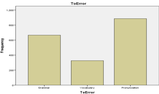
Figure 2. Types of errors

In order to examine the significance of the differences between the frequencies of the types of errors and their expected frequencies, a chi-square goodness-of-fit test was run. As shown in Table 8, the frequencies for vocabulary and pronunciation were noticeably different from their expected frequencies while the number of grammatical errors receiving CF was close the expected frequency for this error type. Based on the table, errors of pronunciation were treated more than expected, while errors of vocabulary were addressed greatly less than expected. According to the result of the chi-square test (Table 9), there were significant differences between the observed and expected frequencies for types of errors being treated through CF, X^2(2, n= 1878) = 244.1, p = .000 .