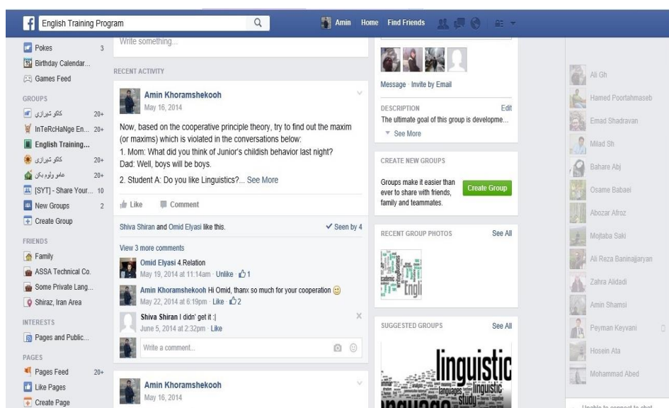
Figure 2 The ACMC group's virtual instructional environment

The participants of the control group, also, received the instructional materials two times a week (each time about half an hour) through traditional teacher-fronted classroom setting. In each session, they were provided with a dialogue containing implicatures in a specific context. Then, they were encouraged to interpret the dialogue and discuss it with their peers. Afterwards, they were given meta-pragmatic information about how to interpret each implicatures type.