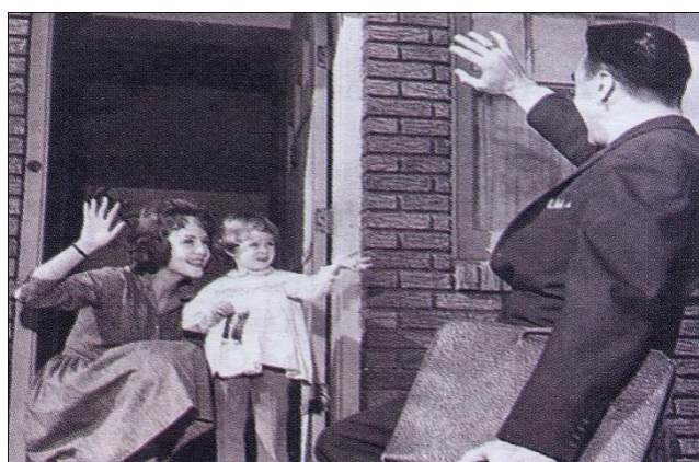
Figure 7: Interchange Student's Book 2 (Richards, 2005, p. 14).

The two female participants in Figure 7 are, on the one hand, separated from the man by the framelines formed by the right edge of the door and, on the other hand, they are represented as belonging to the context of home because they are positioned within the frame formed by the edges of the door and also the dark shade behind them. In fact, the edges of the door and the dark part within the frame of the door divide the picture into two parts: home and outside . The man is depicted as belonging to outside (activities) while the females are shown as belonging to home; these representations also seem to be stereotypical.